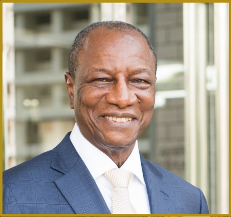
HEM the President of the Republic of Guinea, Professor Alpha Condé

The event is organized by the Private Investment Promotion Agency (APIP-Guinea) in collaboration with the African Development Bank (ADB) and the World Bank through its subsidiary the International Finance Corporation.